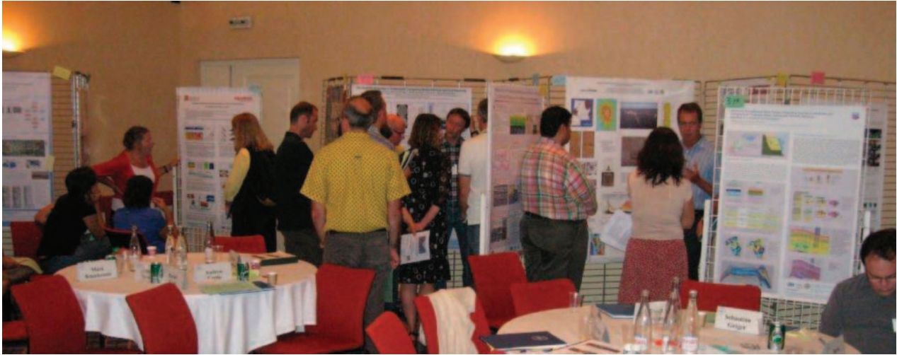
Figure 2. Speed dating at the posters.

saturated with brine and crude oil. The method also offers a way to explore whether changes in surface charge and wetting state are responsible for improved oil recovery during controlled salinity water floods. The importance of being able to visualize directly the distribution of residual phases in the rock pore space based on plug nanometer-scale studies was discussed by Mark Knackstedt (Australian National University). His multiscale imaging approach not only provides insights to recovery mechanisms but also can support the development of upscaling methods for flow properties from pore to plug to core scales. Masa Pradonovic (University of Texas at Austin) also revealed submicron porosity characteristics of carbonate rocks through her ion beam microscopy studies (see more below). An identified challenge for the wettability theme was the need for a set of recommendations or guidelines to represent relative permeabilities for (fractured) multiporosity carbonates with complex diagenetic evolution. Furthermore, current image resolution for tomography imposes limitations on pore-scale visualization and modeling. This said, the potential for pore-scale modeling approaches to advance RTM was highlighted as a promising future research area.